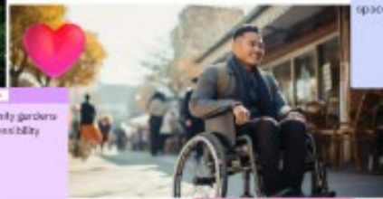
Accessibility in open space