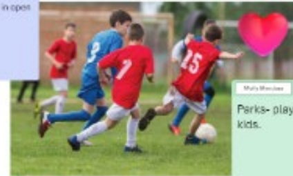
Parks- play areas for kids.