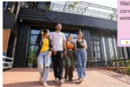
Walking trails and connecting to existing trails system