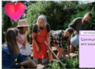
Community gardens and accessibility